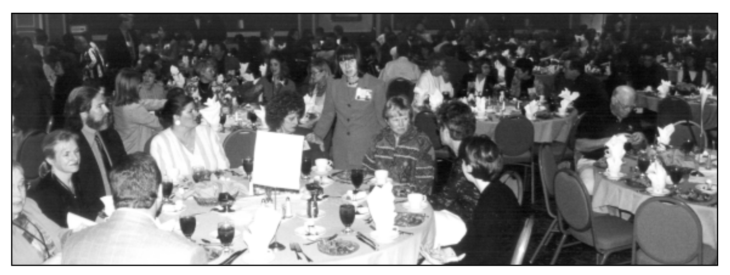
Conference participants enjoying the Awards Luncheon

As the 77<sup>th</sup> Legislative session begins on January 9, 2001, I would like to encourage all TASP members to become involved! I currently have a list of volunteers who have expressed interest in participating in the legislative process. If you have not yet received an e-mail from me, but are interested in becoming more involved, please e-mail me at <u>mkaltman@inetport.com</u> and let me know what areas you are interested in.