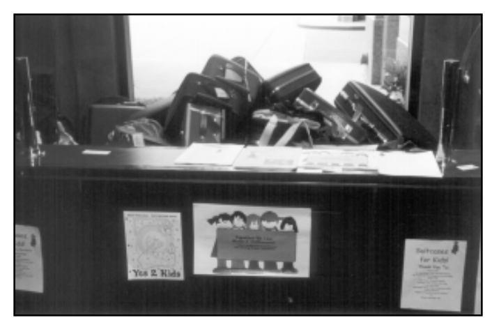
Suitcases collected at the TASP Conference in San Antonio

Finally, we are looking for people that would be interested in acting as associate webmasters for some of the pages. If you are saying to yourself, "I am not a computer science major, I studied School Psychology" or perhaps, you might be saying, "Hey, I am a liberal arts kinda person not a science major...", you are wrong!! It does not take a technical background to work on the website. So, I encourage you that have an interest in the internet and would like to contribute to TASP to come on board. The following are the pages that need support: the job opportunities page, related links page, and the GPR page. I look forward to hearing from some eager volunteers! Come visit us at WWW.TXASP.ORG.