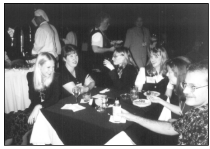
Conference participants enjoying the Presidential Ice Cream Social