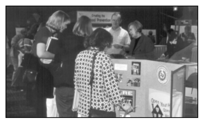
The display area at the TASP conference

The CALF would like to recognize the top-notch efforts of our collection sites for Suitcases For Kids: Regional KinderCare Learning Centers, Northside I.S.D. Psychological Services Department, Seguin I.S.D., Fort Bend I.S.D., Fair Park I.S.D., Northside Children's Center, O'Connor High School Latin Club,